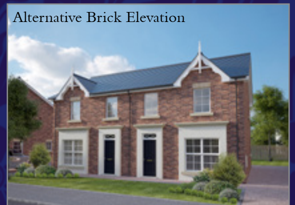
Alternative Brick Elevation