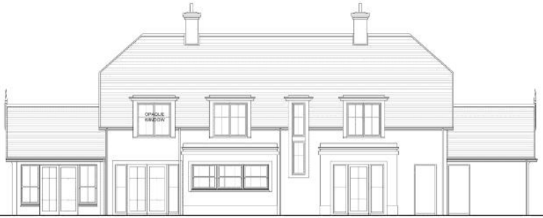
REAR ELEVATION , scale 1:100 JAD/LS