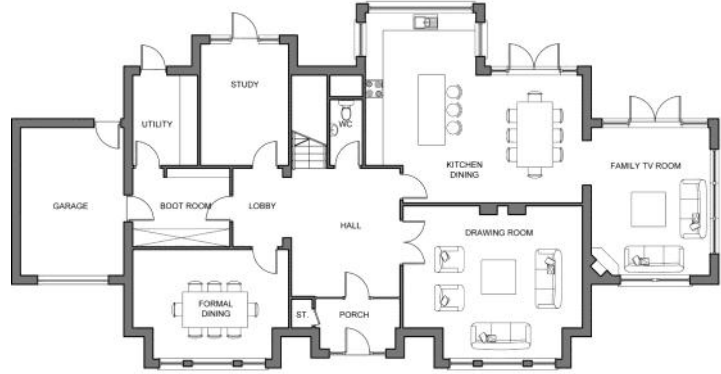
GROUND FLOOR , scale 1:100