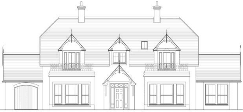
FRONT ELEVATION , scale 1:100