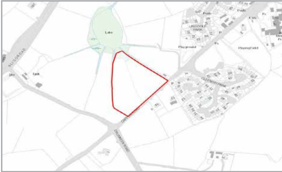
For Indicative Purposes Only