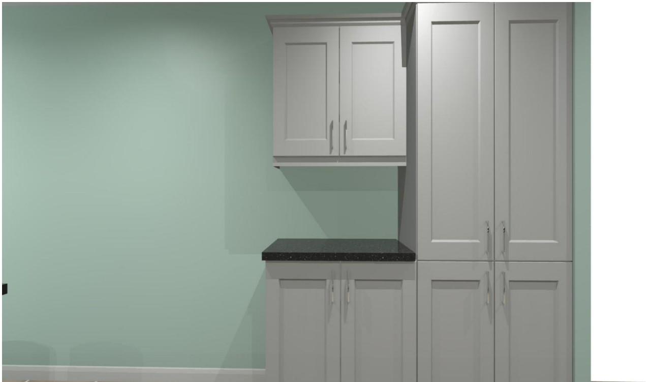
CGI - For Illustration Only