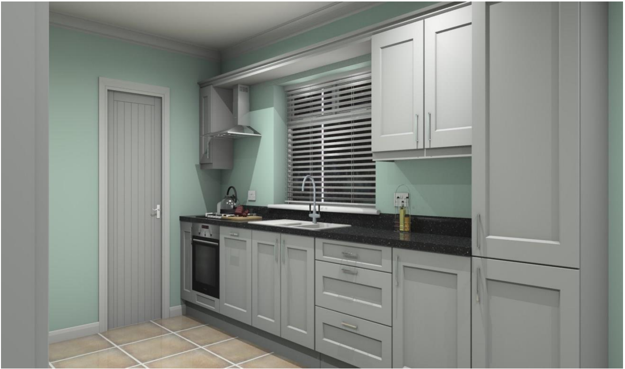
CGI - For Illustration Only