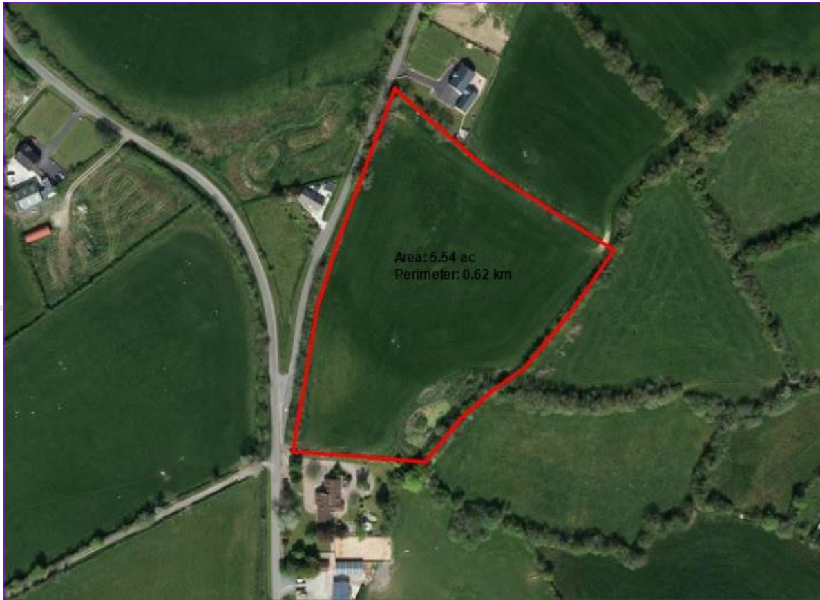
Indicative Spatial Boundary Map (For Indicative purposes only)