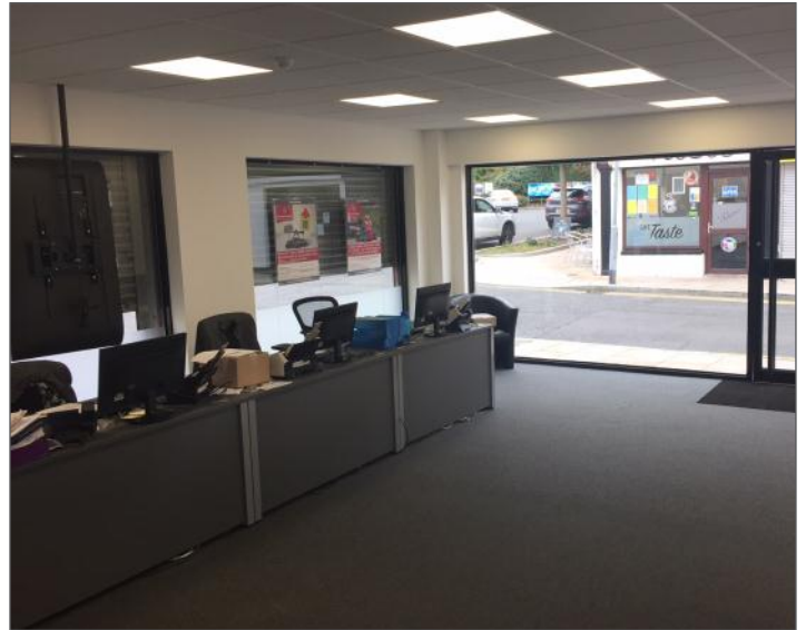
Unit 3 Internal