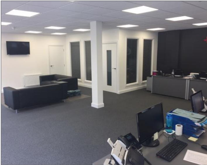
Unit 3 Internal