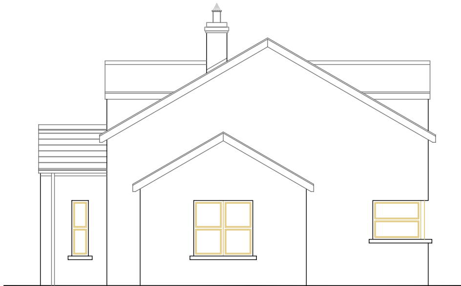
Proposed RHS Elevation -1:100-