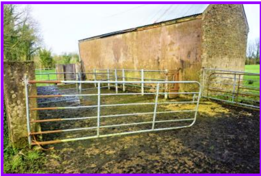
Access from County Road