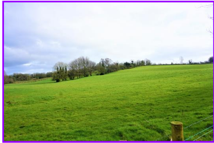
View of Lands to side & rear of dwelling site