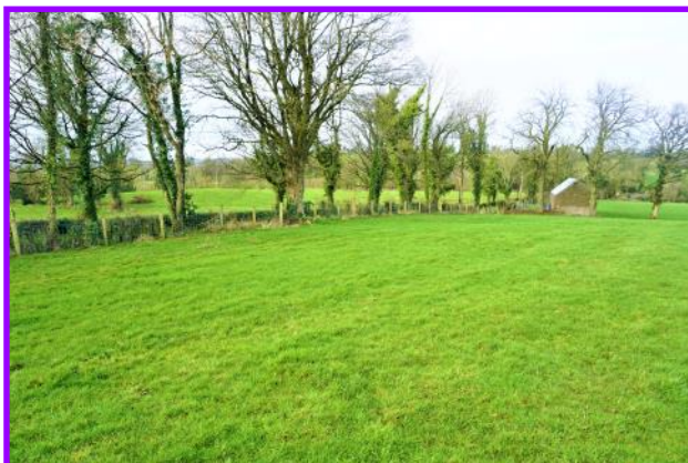
Side view of site