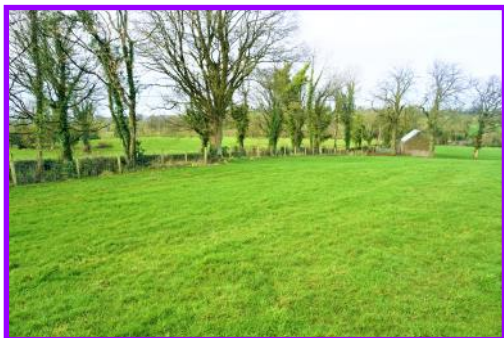
View of Lands