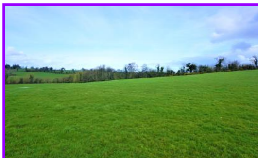
View of Lands