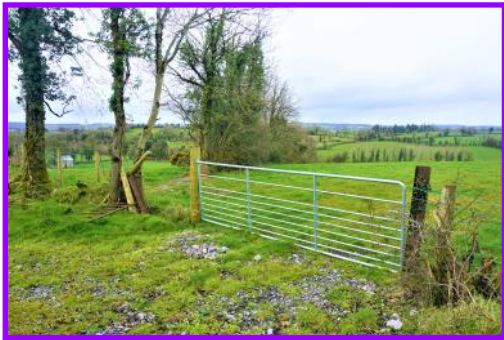
Access from concrete farm laneways