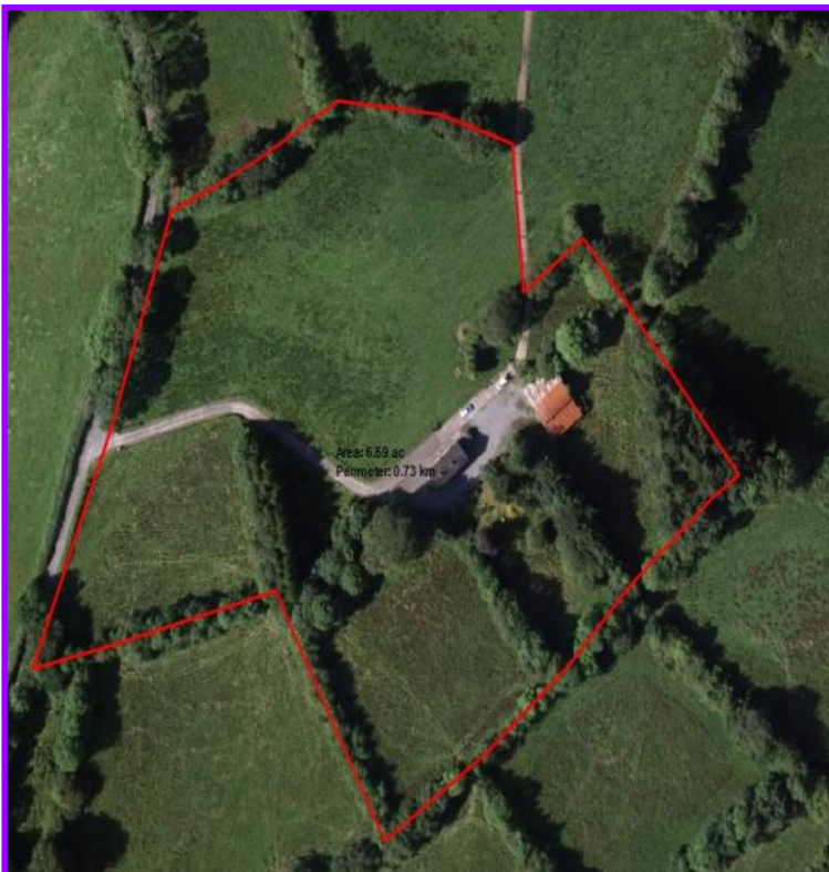
Indicative Spatial Boundary Map (For Indicative purposes only)