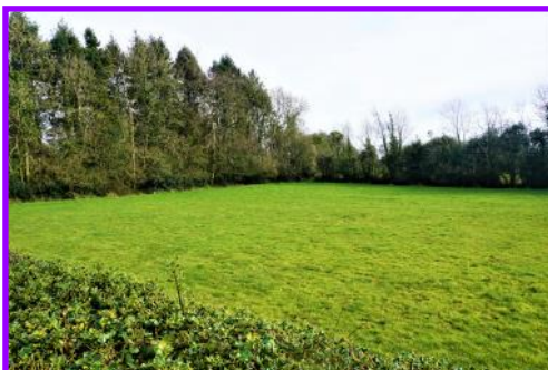
View of Lands