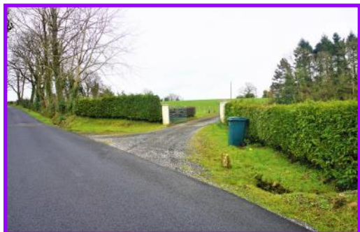
Access from Lisrace Road