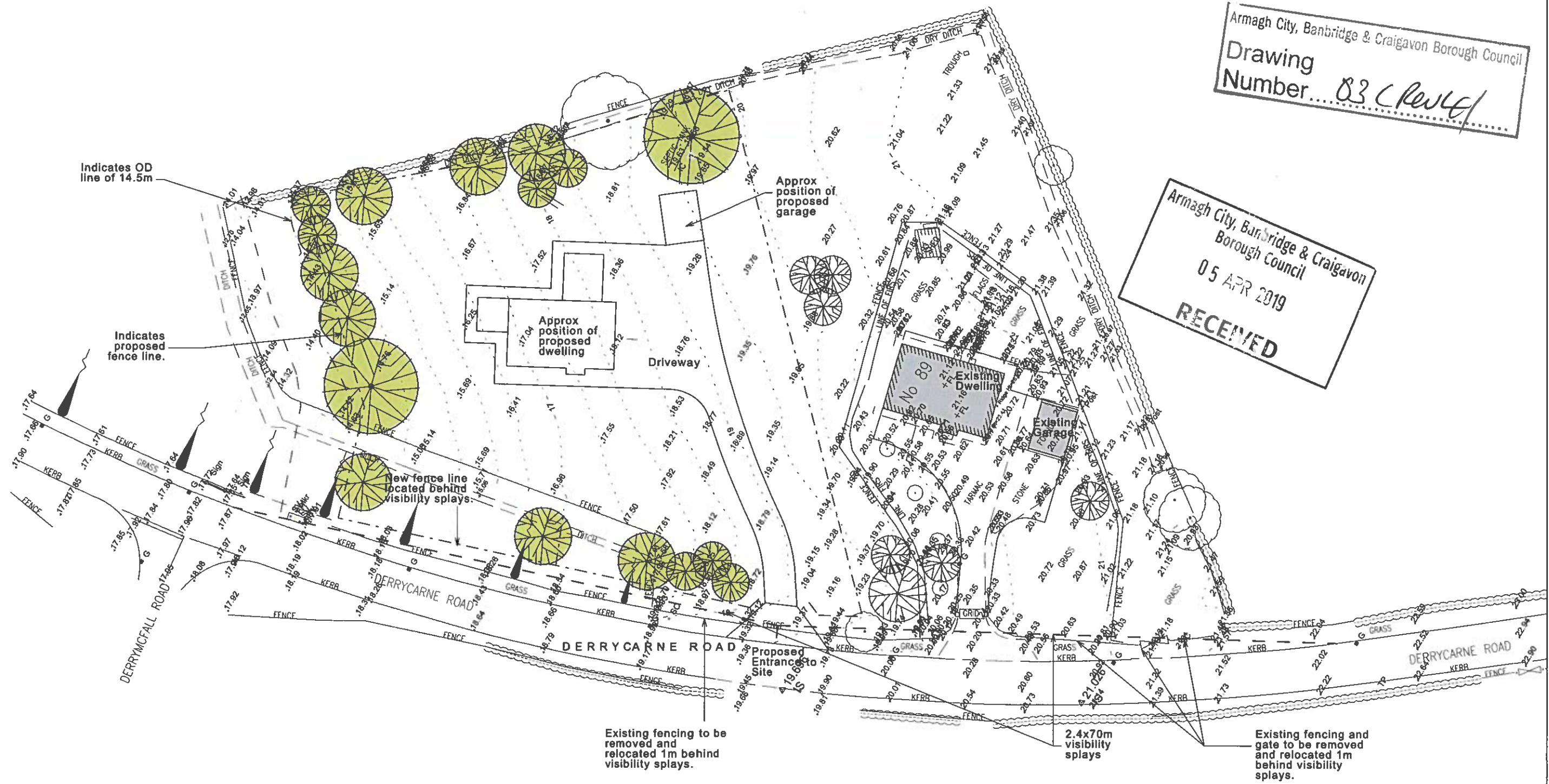
SITE PLAN - SCALE 1:500

Armagh City, Banbridge & Craigavon Borough Council 05 APR 2019 RECEIVED