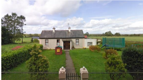
Image of property prior to renovations works commencing

The owners started renovating this property – so it's a work-in-progress! There's a flat roofed extension to the rear and also to the side. It fronts onto two roads, with access front and rear.