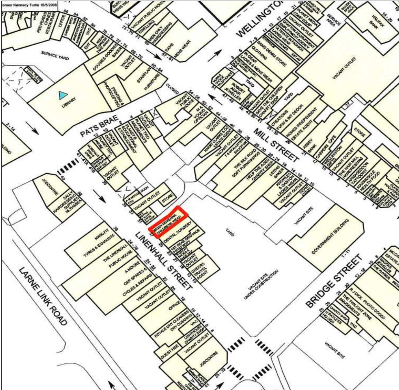
Reproduced by commission of the Ordnance Survey of Northern Ireland on behalf of the controller of Her Majesty's Stationery Office. Crown copyright 2006. Licence No. 1211.